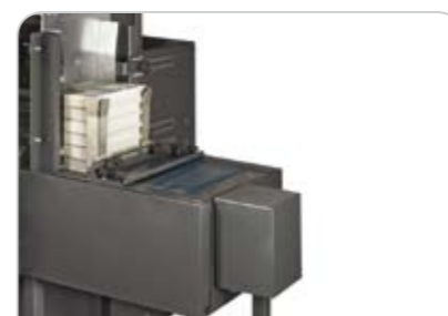
Book stacker (optional)