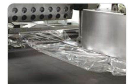
Continuous longitudinal welding system