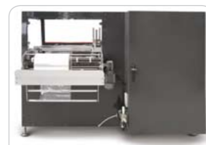
Ergonomic film loading