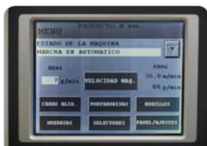
Industrial PC with touch screen