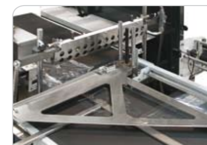
Transversal welding system