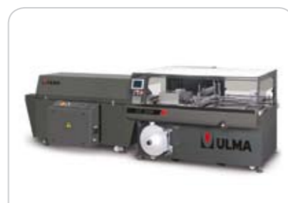
Side seal wrapper machine with shrink tunnel